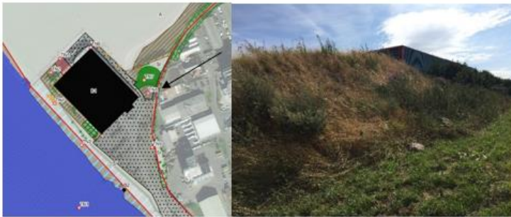
Figure I1: Location and photograph of Himalayan balsam within Order Limits

4.2.2.1 Himalayan balsam has been identified at a single location within the Railway Reinstatement Land, growing amongst tall ruderal vegetation on a raised earth bund beside a building on the north-west side of the Flixborough industrial estate (Figure I1). Surveys also noted additional areas of Himalayan balsam along the River Trent, however these are outside of the Order Limits.